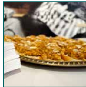
Beautiful Food Catering by Renée Deall